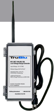
Suitable For Interior Or Exterior Use

*Note: Bluetooth Range is highly dependent on the integration of fixtures, surrounding environment and conditions. It is recommended to conduct testing for range accuracy.