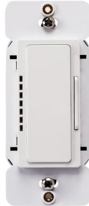
Suitable for Indoor Use Only